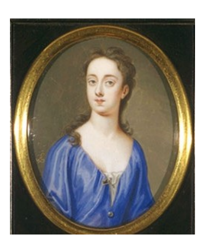
Miniature Portrait of Sarah Churchill, Duchess of Marlborough Bernard Lens III the younger England (probably London), 1720

shows remarkable similarities. Both women sport the same low neckline, unadorned neck, and pulled back hairstyles. Rachel Carlyle, it would appear,